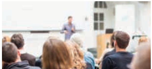
Getting involved in our communities