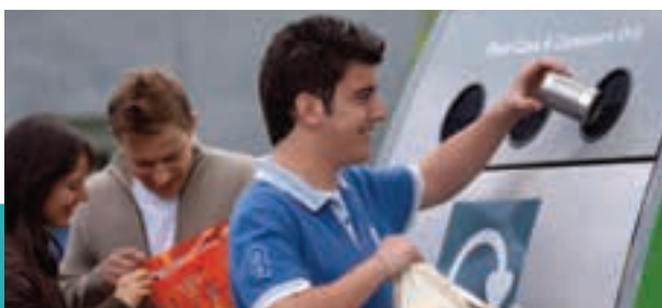
Protecting our environment