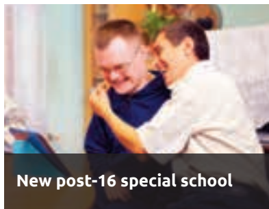
New post-16 special school