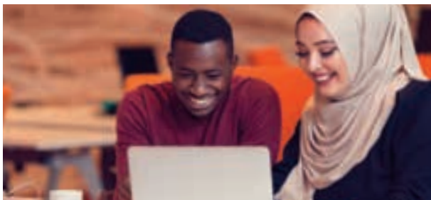
Using the council's online services