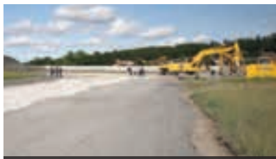
South Ferriby flood defence scheme