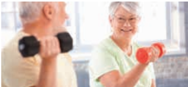
Taking care of ourselves and others