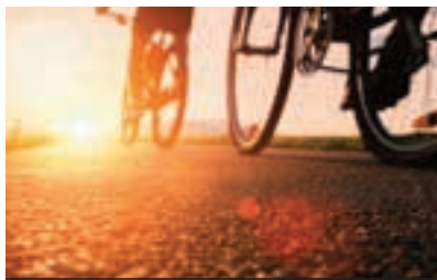
Ancholme Valley Way