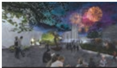
Scunthorpe town centre improvements