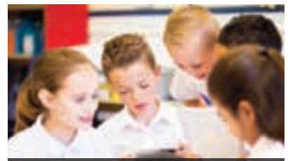
School building improvements