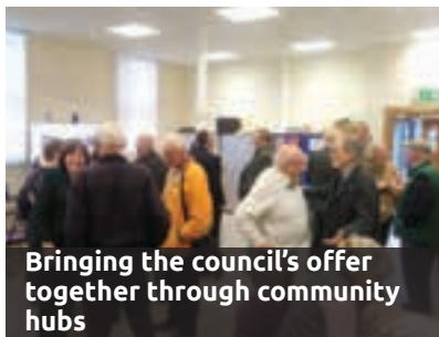
Bringing the council's offer together through community hubs