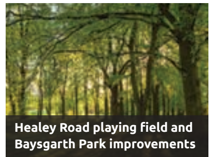
Healey Road playing field and Baysgarth Park improvements