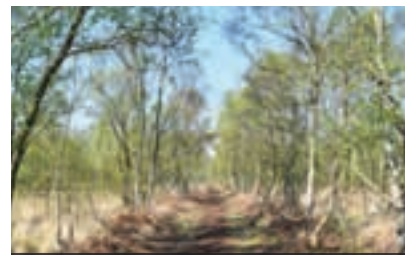
Isle of Axholme greenway