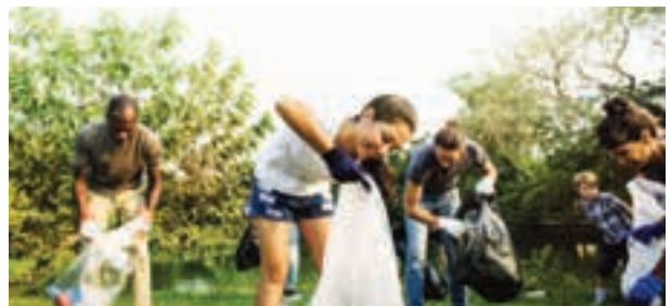
Taking pride in our area